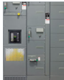
ArcBlok MCC Arc Flash Event: 100kA @ 480V