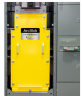
Cable vault is designed to isolate arcs on the line side conductors