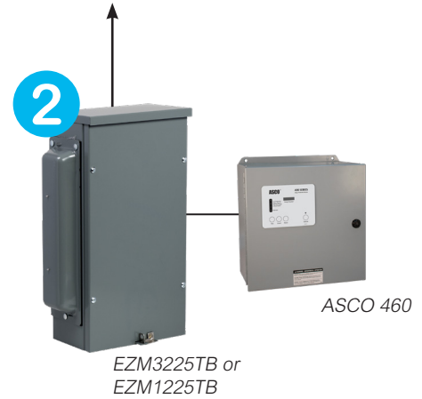
EZM3225TB or EZM1225TB