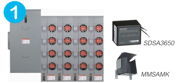
EZ Main & Meter-Pak Meter Center

Contact your local Square D office or Surge regional product specialist to discuss the best option for your unique project requirements.