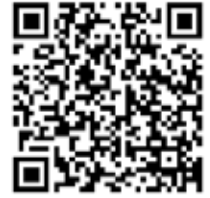
Apple QR Code