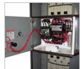
Square D replacement MCC unit installed in General Electric 7700 Series structure

For both the direct replacement and retrofill modernization solutions, new cubicle doors are provided to match the existing equipment and new circuit breaker face.